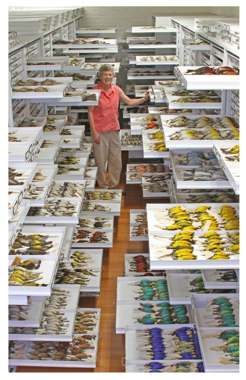
Figure 2. Natural history museum collections are tremendous repositories of specimens and data of many sorts, including phenotypes, tissue samples, vocal recordings, geographic distributions, parasites, and diet. doi:10.1371/journal.pbio.1001466.q002

widespread occurrence of lateral gene transfer. However, the phylogeny of these organisms and their genes remains critical to understanding their scope, origins, distributions, and change over time [92]. The advent of metagenomic sequencing of environmental microbial communities has revealed greater diversity and flux of genotypes than ever imagined, defying conventional species concepts and presenting a major challenge to applying traditional evolutionary and ecological theory to understanding microbial diversity